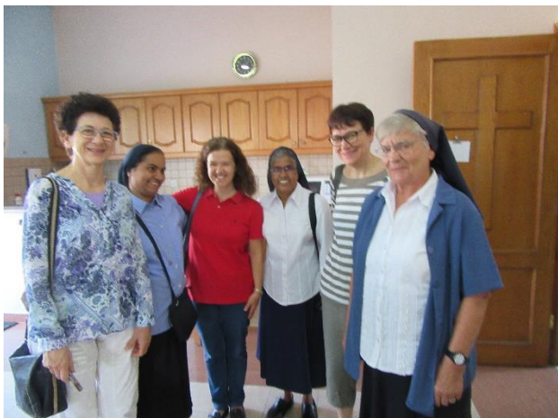
We didn't get a group picture of everyone but here are some who stood still long enough to get a photo