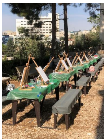
All ready, waiting for the children

Here are some pictures from the day – and more on the website: