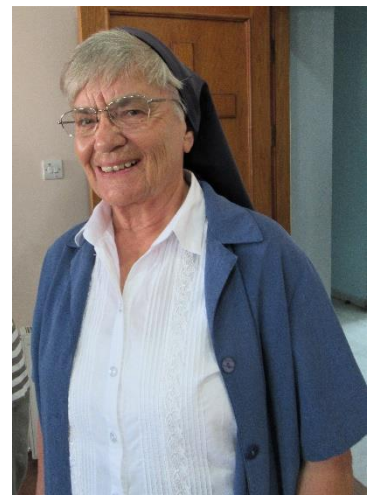
Next stop - Rome. She said she hopes people will come and visit her there.