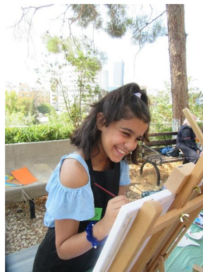
Art is Fun!