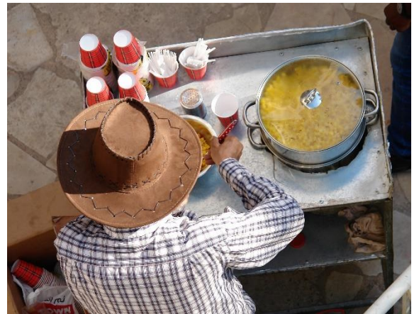
Everybody got a hat - even the Hot Corn guy!