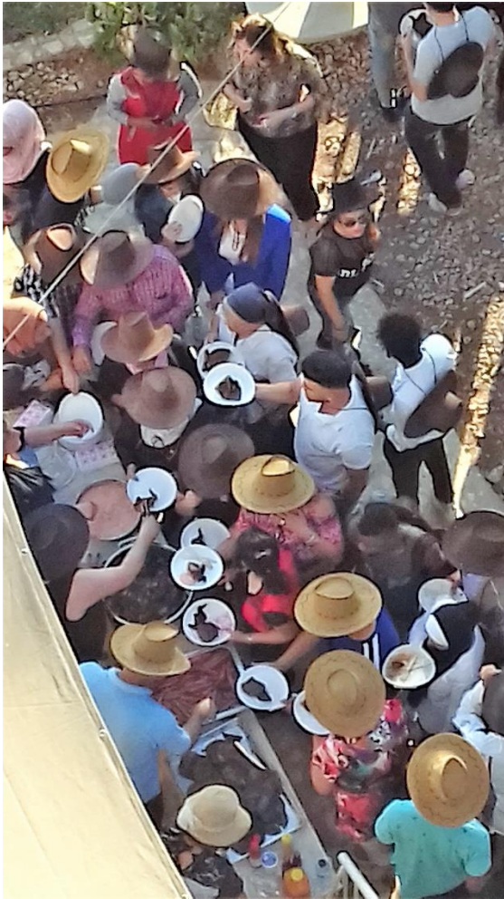
Someone rang the dinner bell!!!