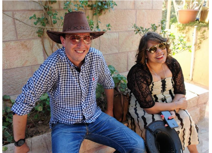
Everybody's a Cow Poke