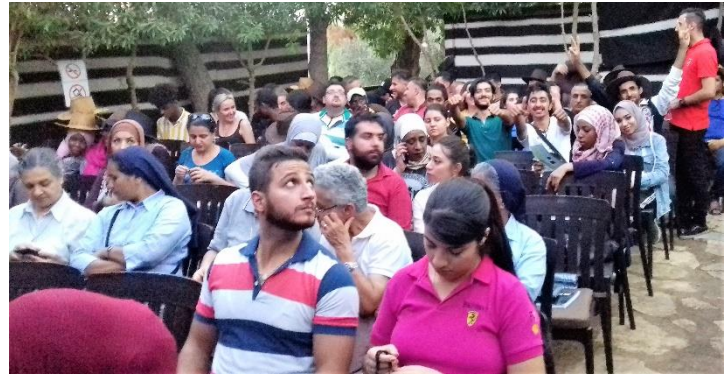
Waiting for the Show to Begin