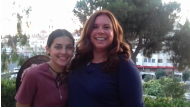
Serving up the chili