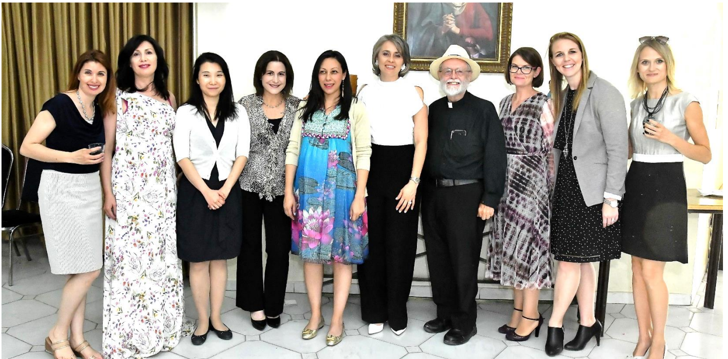
A thorn among the roses. A group of First Communion class mothers can do ANYTHING!!!