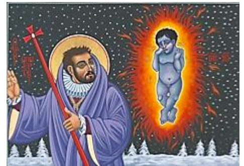
THE BURNING BABE

As I in hoarie Winters night stode shivering in the snow Surpris'd I was with sudden heate, which made my heart glow; And lifting up a fearful eye, to view what fire was neare, A pretty babe all burning bright did in the air appeare: Who scorched with excessive heat, such floods of teares did shed. As though his floods should quench his flames, which with his teares were bred: