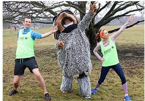
Can you imagine running 42.195 km in that suit?

Let us continue to pray for one another and help each other whenever we can.